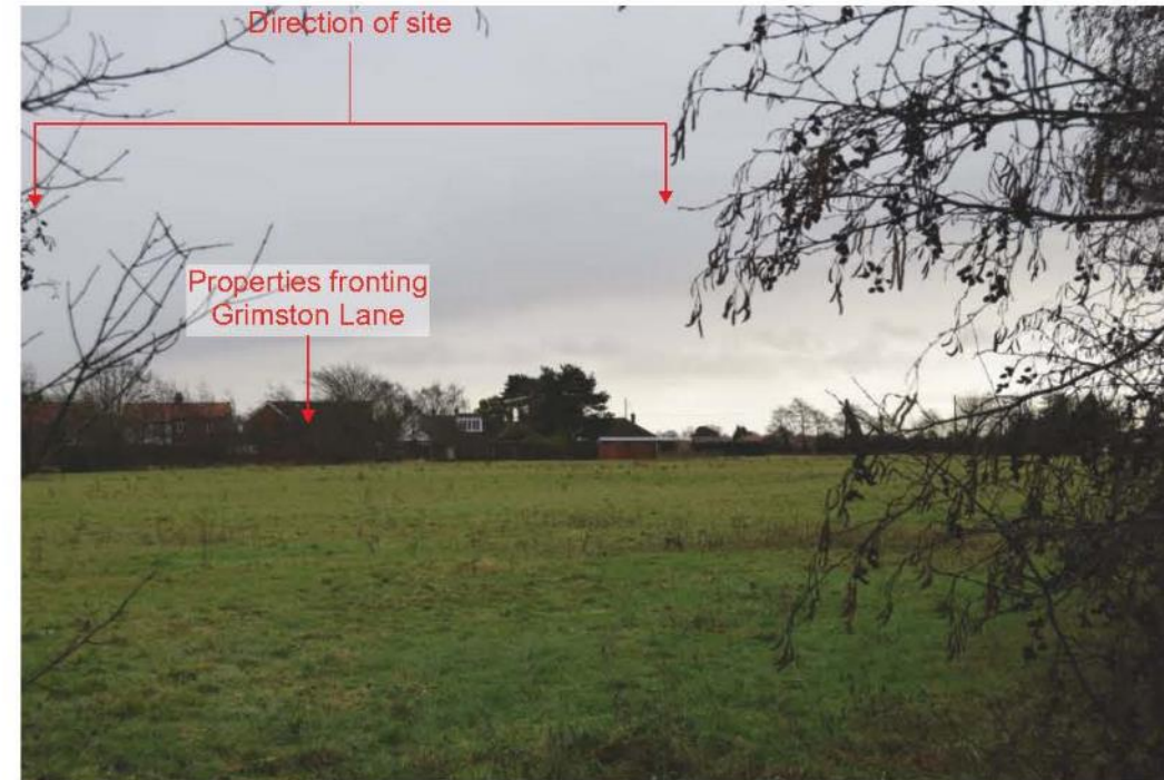
Viewpoint 23: From footpath PRoW E-527 001/0, approximately 930m from site, looking south-east. The site is not visible due to built form.