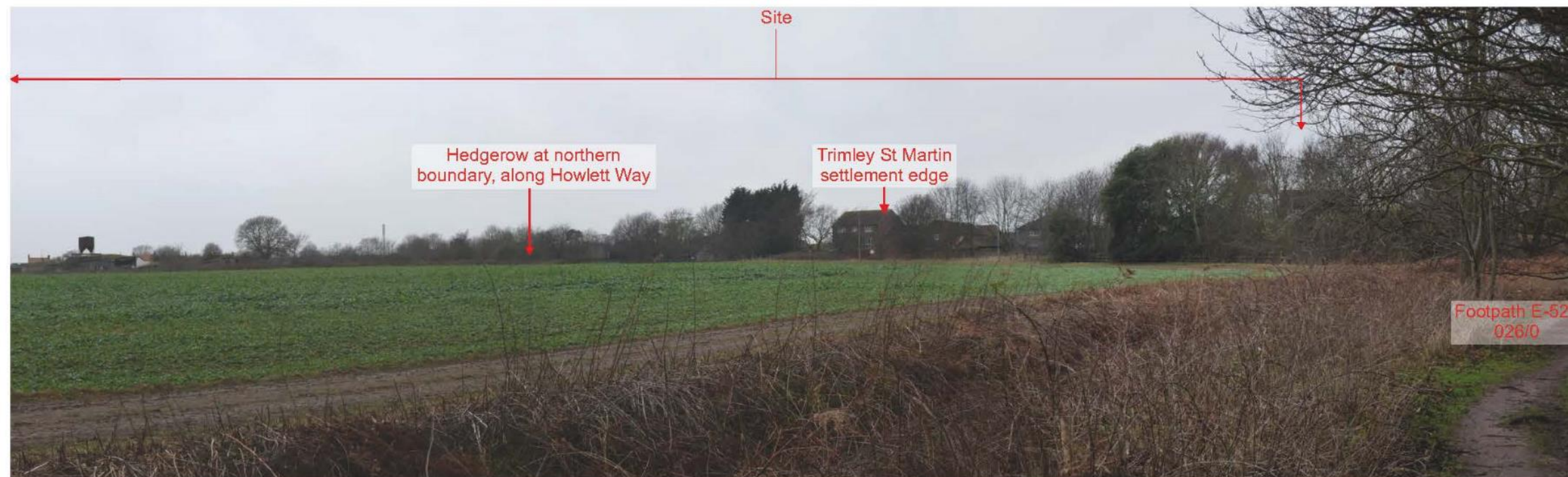
Viewpoint 7b: From Footpath E-527 026/0 looking north-west. Development on the site would be openly visible. Trimley St Martin is visible from the viewpoint location due to minimal boundary vegetation cover along Howlett Way. The view of Trimley St Martin would be lessened in the summer months when the trees are in leaf.