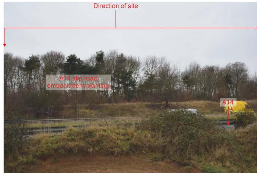
Viewpoint 25: From bridleyway E-528 040/0, looking west across the A14. The site is not visible due to the A14 slip road embankment and planting.