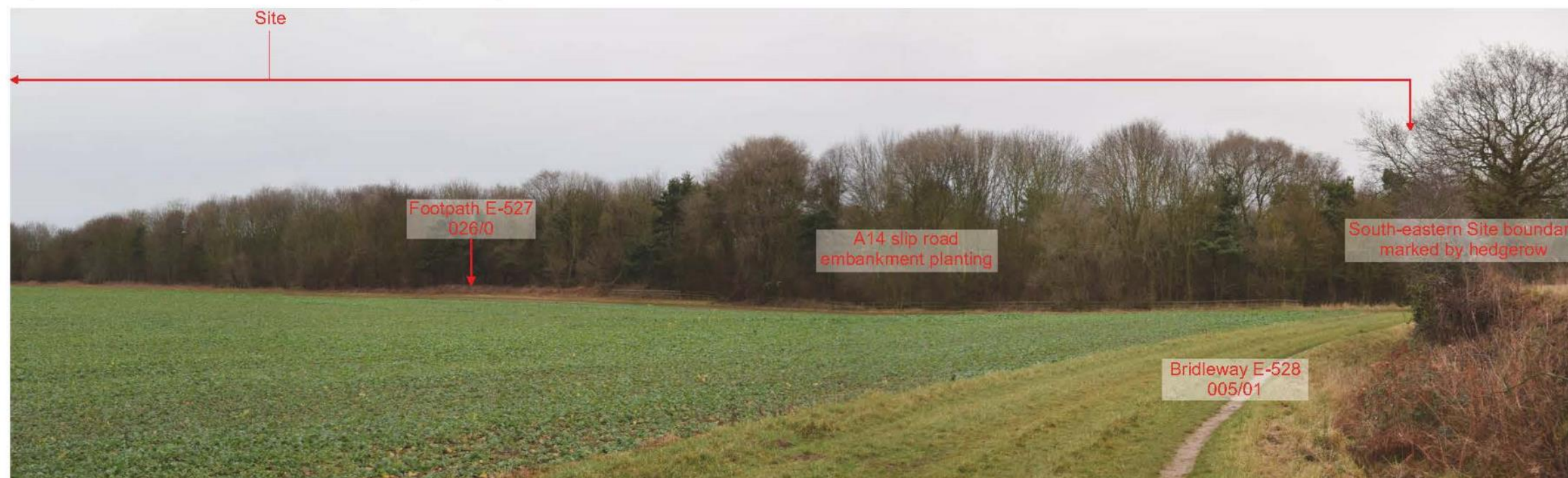
Viewpoint 4c: Internal view from Bridleway E-528 005/01, looking east toward the A14. Dense embankment planting screens the A14 slip road and creates significant visual boundary to the A14. There are glimpses of the footpath to the east of the site which is contained within the embankment planting.