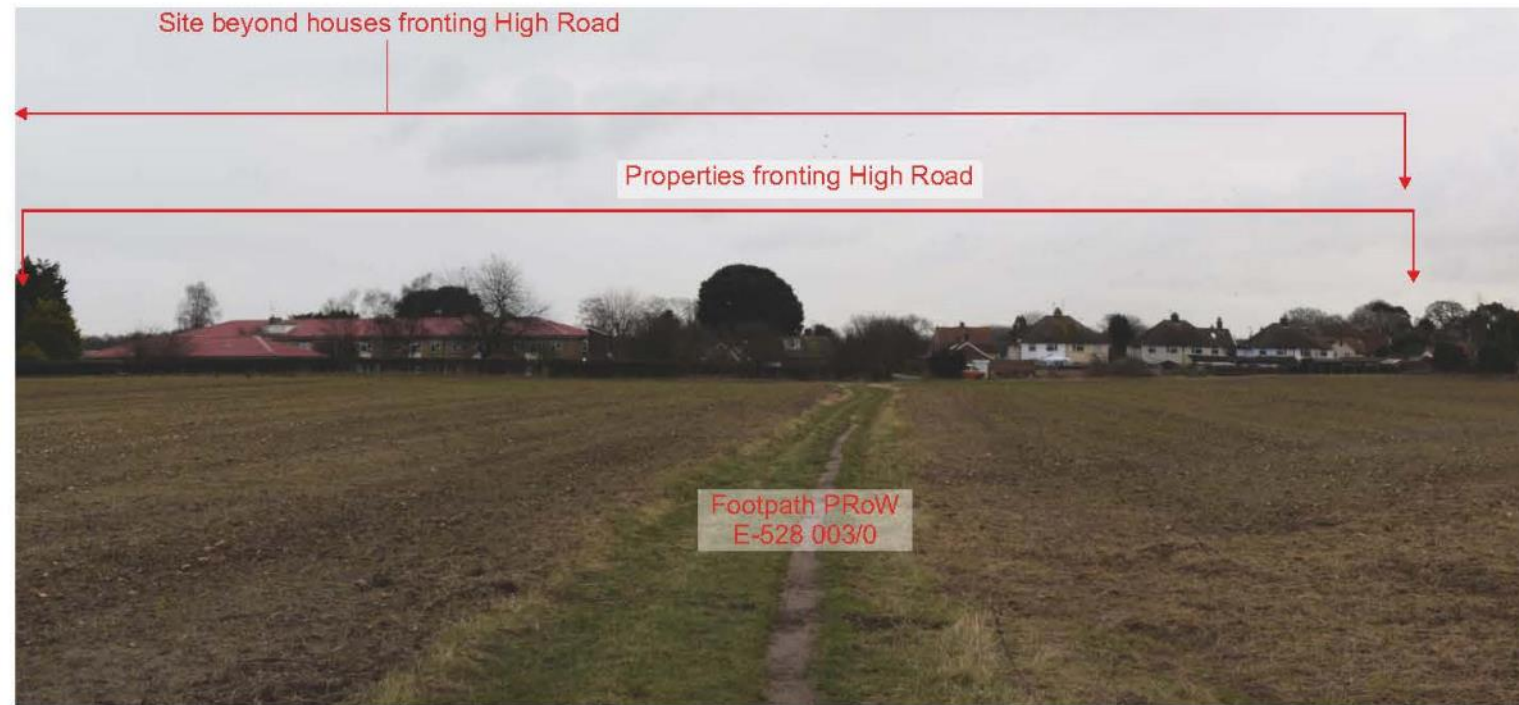
Viewpoint 19: From Public Right of Way PRoW E-528 003/0, circa 350m from the site, looking east. The site is not visible due to built form.