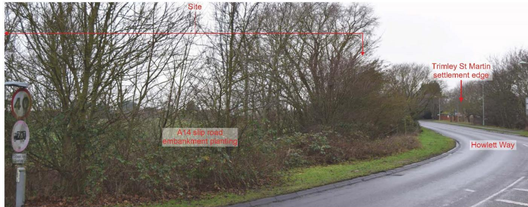
Viewpoint 9b: From the A14 Trimley St Martin slip road, looking south-west towards site. There are glimpsed views of the site through dense vegetation which may be lessened in the summer months when the vegetation is in leaf.