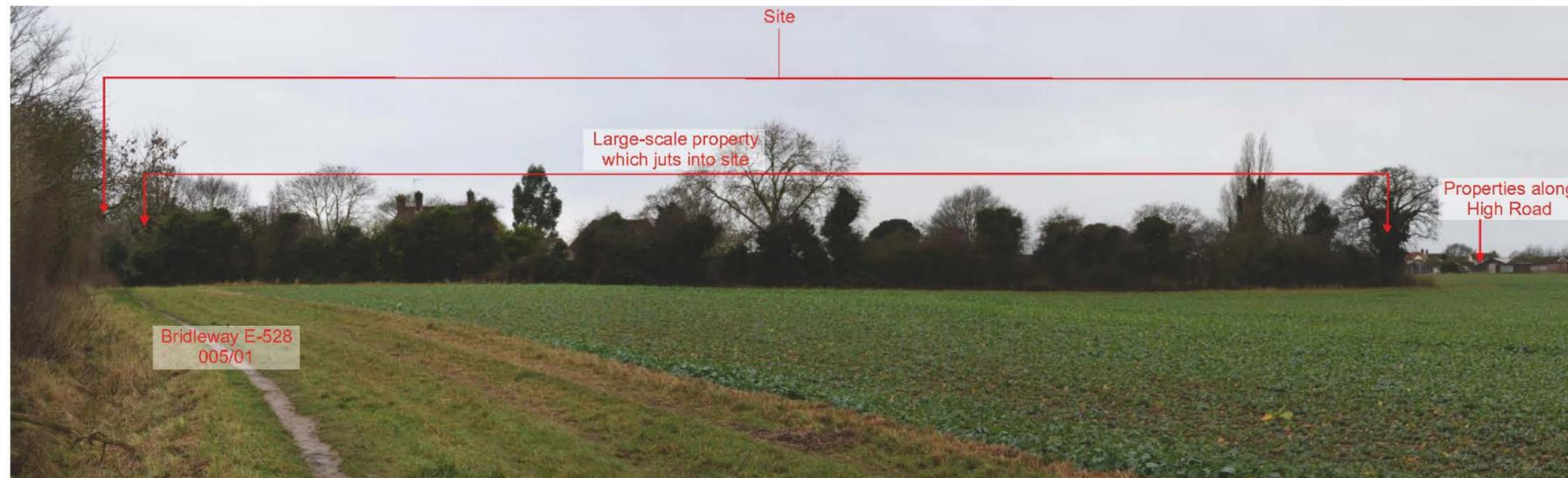
Viewpoint 4a: Internal view of site from bridleway E-528 005/01, looking west towards private property on Church Lane. Development on the site would be openly visible. The garden of the private property contains a number of mature trees and hedges, which provide screening to the buildings within, and may provide further screening in summer months.