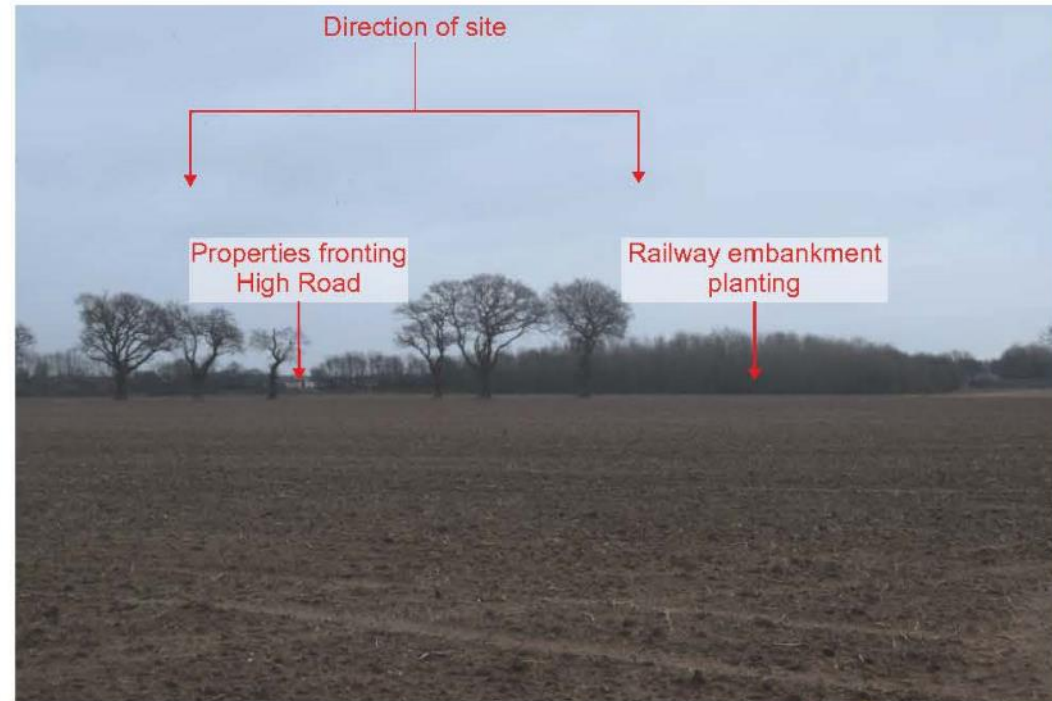
Viewpoint 22: From :PRoW footpath E-527 034/0, approx 980m from site, looking north-east. The site is not visible due to the railway embankment planting.