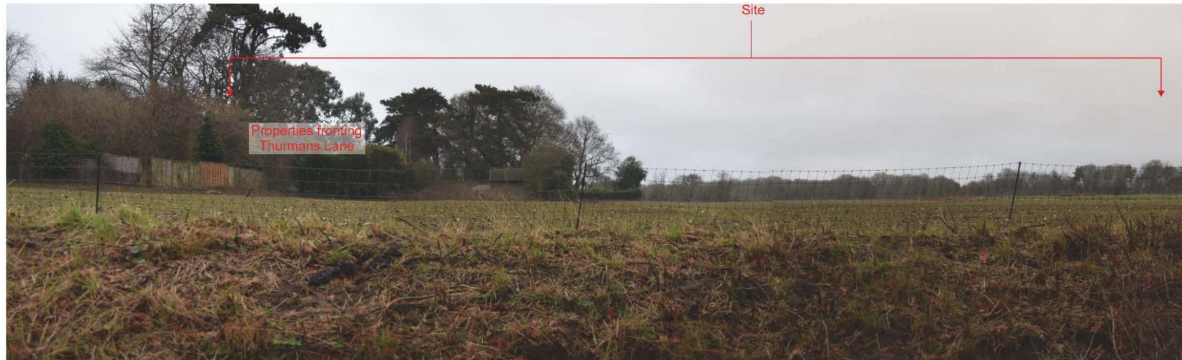
Viewpoint 17: From Thurmans Lane circa 200m south of the site, looking north towards the site. The ground plane of the site is not visible due to the sloping topography of the adjacent field.