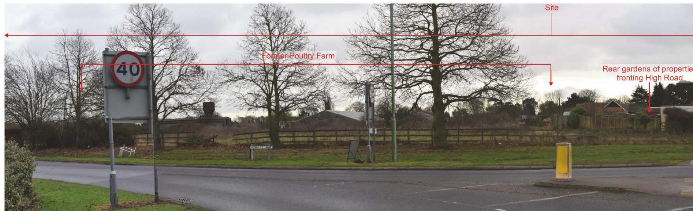
Viewpoint 12: From footpath on north side of junction of Howlett Way and High road looking south-east. There are glimpsed views into the site through scrubby vegetation which is framed by large, mature trees lining Howlett Way and development on the site would be visible. Development is visible within the gardens of the properties fronting High Road.