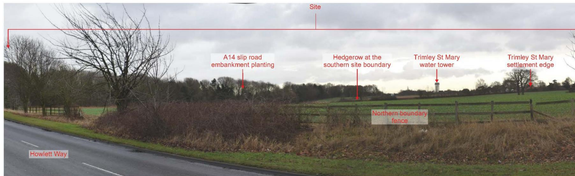
Viewpoint 11a: From Howlett Way looking south into site. There are open views into the site through scrubby vegetation and development on the site would be visible. The development to the south of Thurmans Lane is visible from this distance but may be lessened in the summer months when boundary trees and hedgerows are in leaf. The water tower in Trimley St Martin is visible which may act as a local waymark.