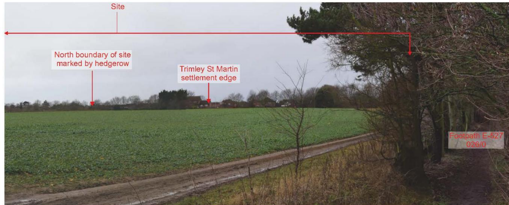
Viewpoint 5b: Internal view from the juncture of bridleyway E-528 005/01 and footpath E-527 026/0, looking north across the site. There are glimpsed views of Trimley St Martin settlement boundary, along Howlett Way which may be lessened in the summer months when the trees lining Howlett Way are in leaf. The footpath sits within the embankment planting of the A14 slip road with occasional open views into the site.