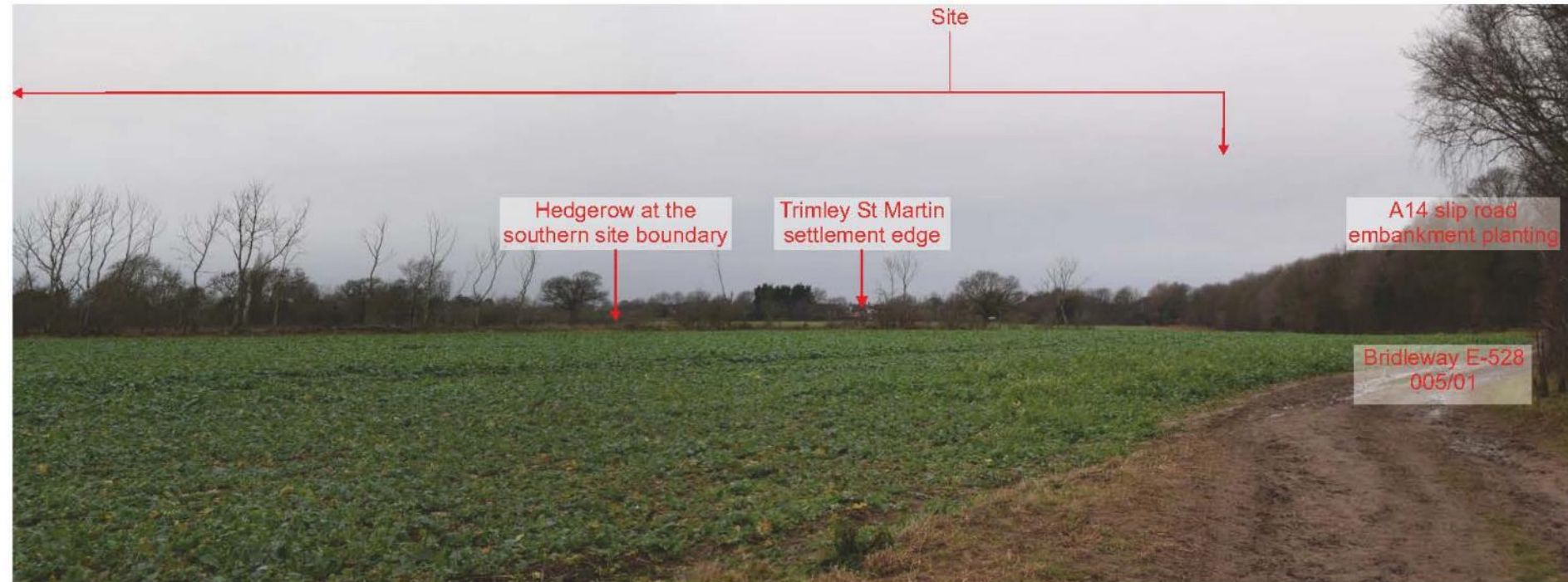
Viewpoint 6: From Bridleway E-528 005/01 circa 200m south-west of site boundary, looking north-west. Development on the site would be openly visible. There are glimpsed views of Trimley St Martin settlement boundary, along Howlett Way which may be lessened in the summer months when the southern boundary hedge and trees lining Howlett Way are in leaf. The embankment planting to the west provides a dense visual screen to the A14 slip road.