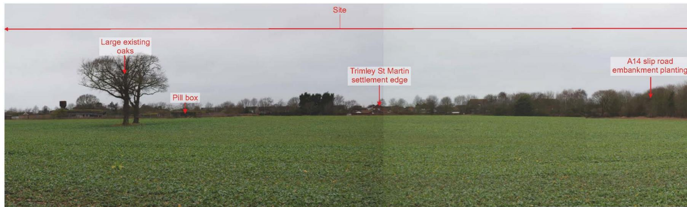
Viewpoint 4b: Internal view from Bridleway E-528 005/01, looking north towards Howlett Way. Development on the site would be openly visible. There are glimpsed views of Trimley St Martin settlement boundary, along Howlett Way which may be lessened in the summer months when the trees lining Howlett Way are in leaf.