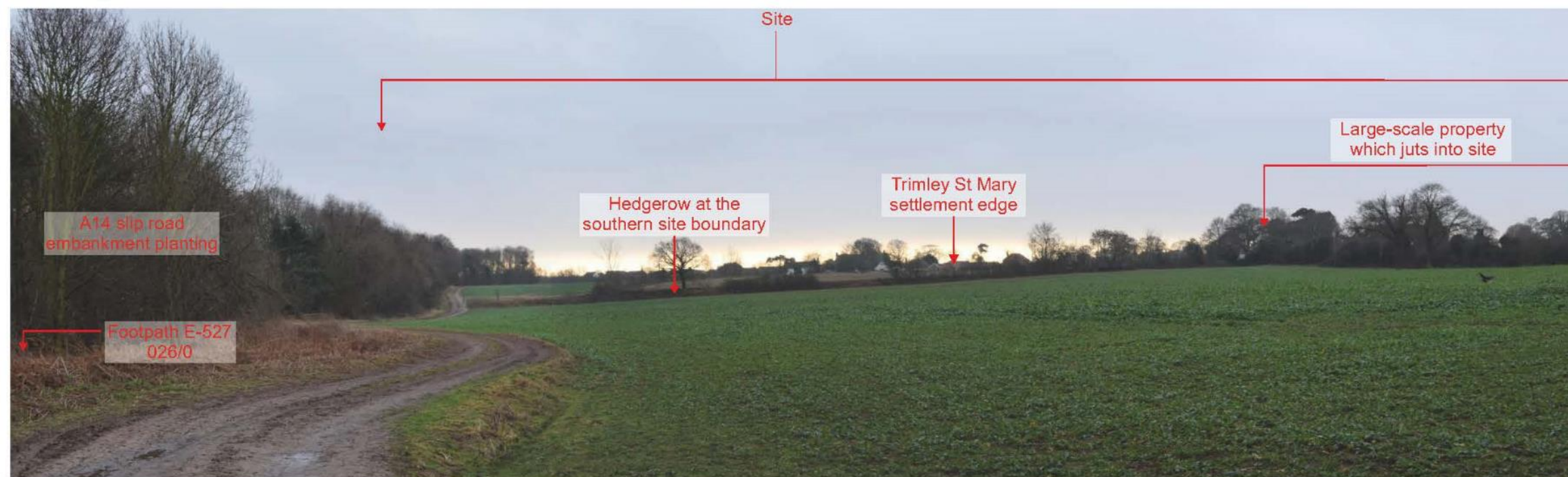
Viewpoint 8a: Internal view from north-eastern most point of the site from public footpath E-527 026/0, looking south-west. Development on the site would be openly visible. The development to the south of Thurmans Lane is visible from in the distance through field boundary trees and hedges which may be lessened in the summer months when the trees and hedgerows are in leaf.