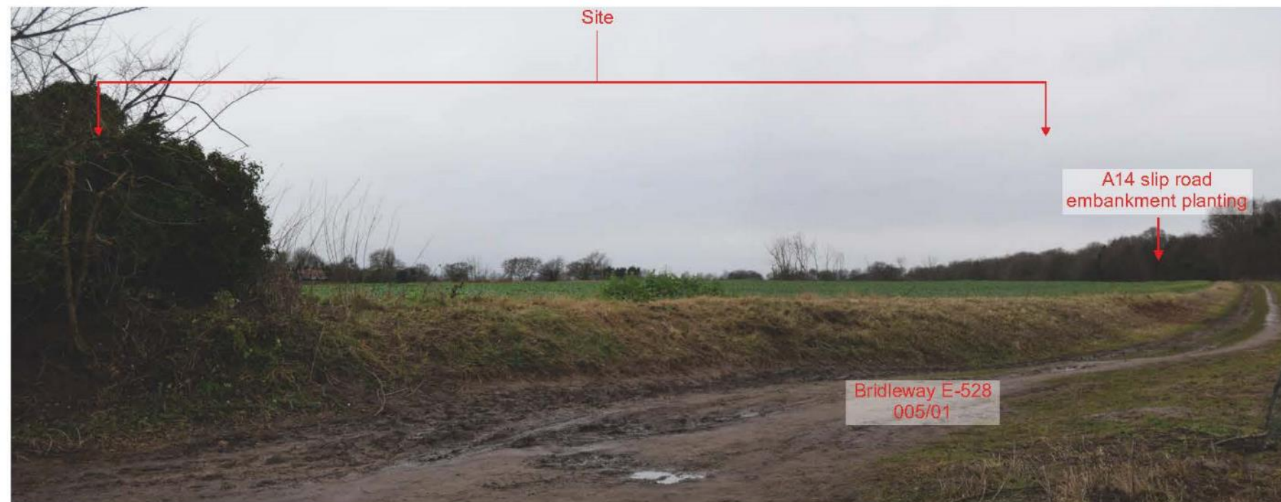
Viewpoint 16: From Thumans Lane looking north towards site. The ground plane of the site is not visible due to the sloping topography of the adjacent field. It is not possible to tell if potential built form would be visible from this viewpoint.