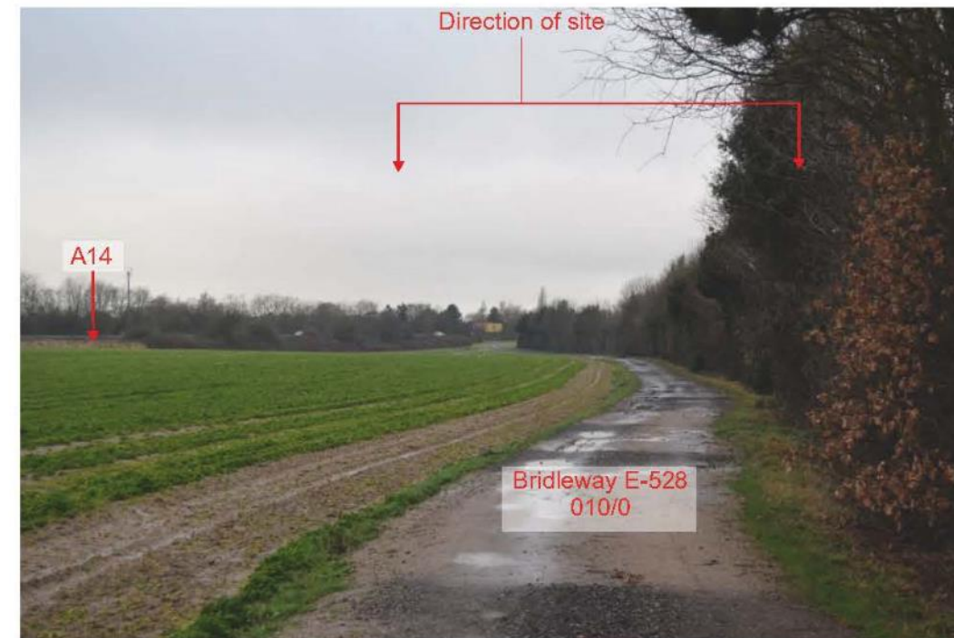
Viewpoint 27: From bridleyway E-528 010/0, Circa 100m from site, looking north-west. The site is not visible due to dense tree planting and the A14 embankment planting.