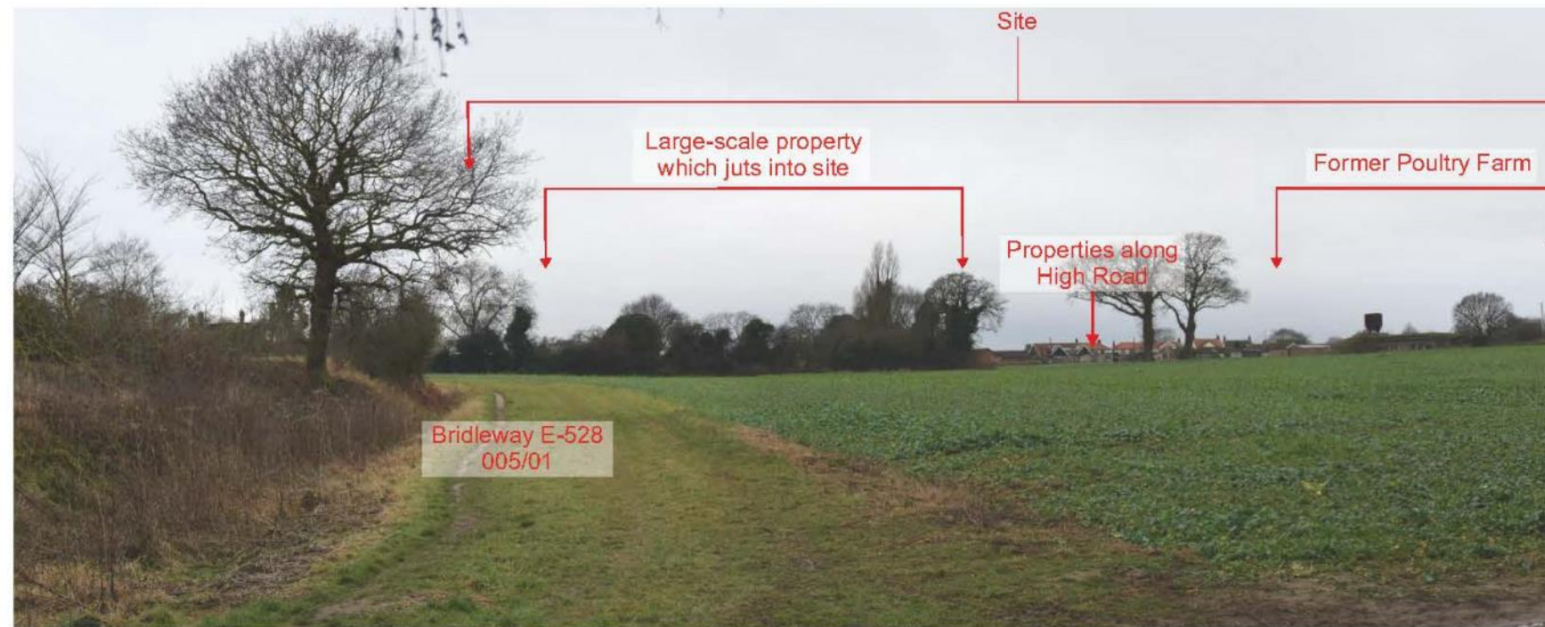
Viewpoint 5a: Internal view from the juncture of bridleyway E-528 005/01 and bridleyway E-528 005/02, looking north-west across the site. Development on the site would be openly visible. Views are open to the rear of properties that front onto High Road.