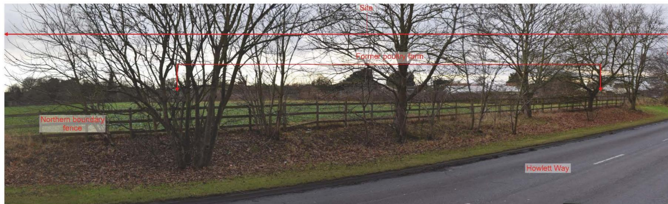
Viewpoint 11b: From Howlett Way looking south into site. The view into the site is lessened due to the denser vegetation along the northern boundary of the site, which may be lessened further during the summer months when the vegetation is in leaf.