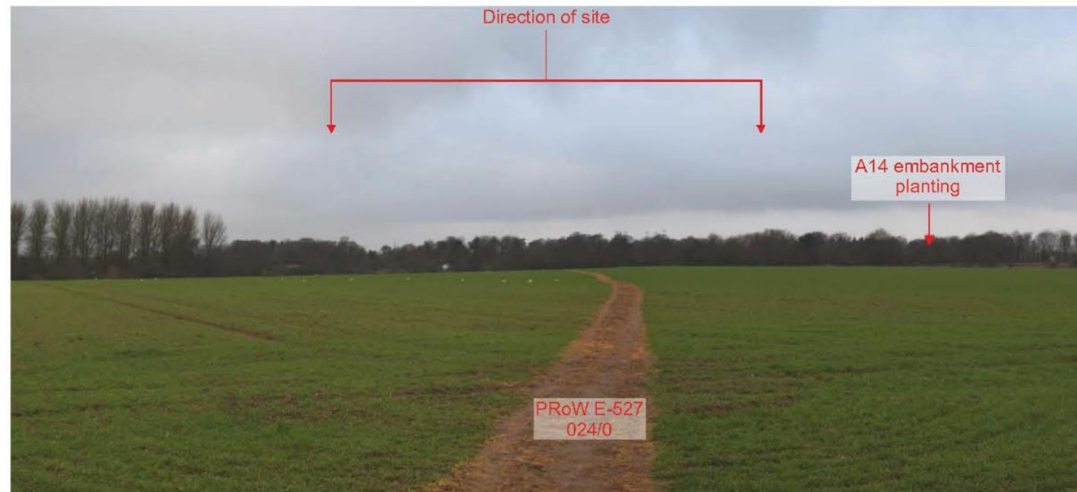
Viewpoint 24: From public footpath PRoW E-527 024/0, circa 500m from site looking south-west. The site is not visible due to the topography and A14 embankment planting.