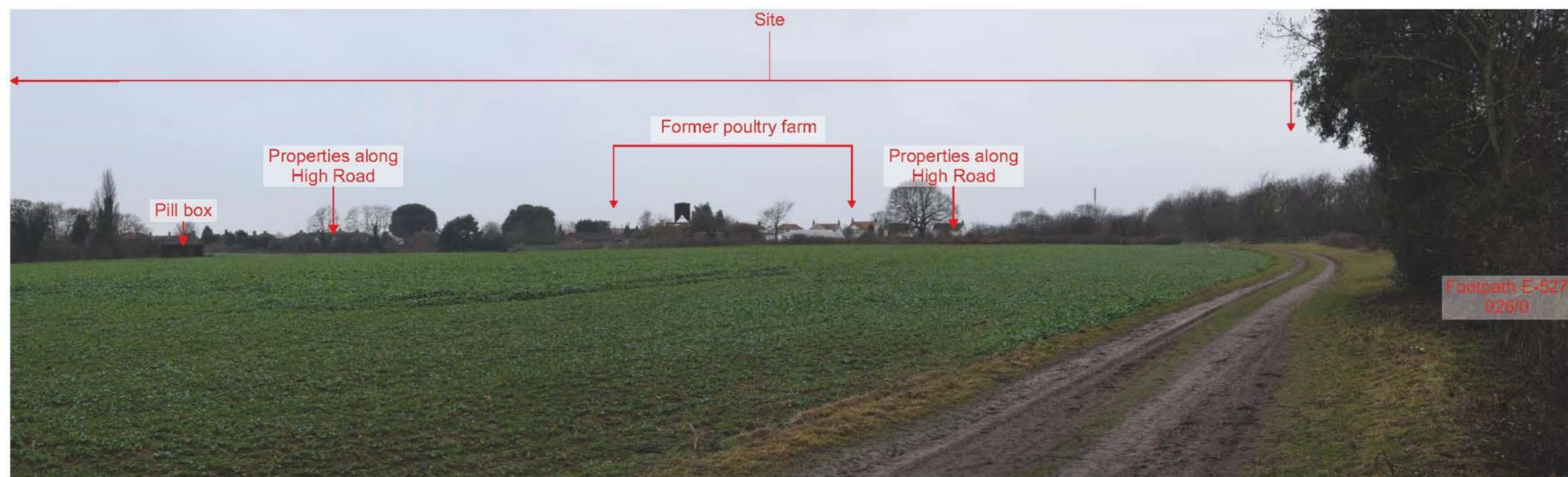
Viewpoint 8b: Internal view from north-eastern most point of the site from public footpath E-527 026/0, looking south-west. Development on the site would be openly visible. The rear elevations of the properties fronting High Road are visible but have partial screening from scrubby vegetation adjacent to the former poultry farm and garden planting.