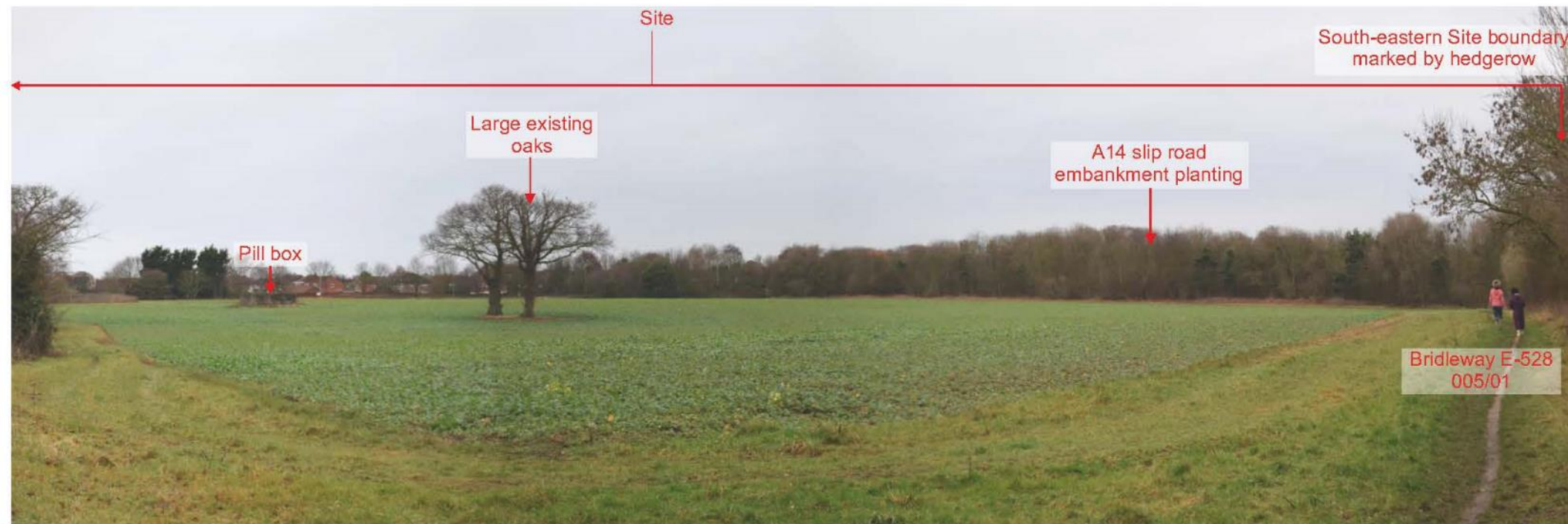
Viewpoint 3: From juncture of bridleway E-528 005/01, Church Lane and edge of the large-scale property boundary, looking north-east across site. Development on the site would be openly visible. There are glimpsed views of Trimley St Martin settlement boundary, along Howlett Way which may be lessened in the summer months when in the trees lining Howlett Way are in leaf.