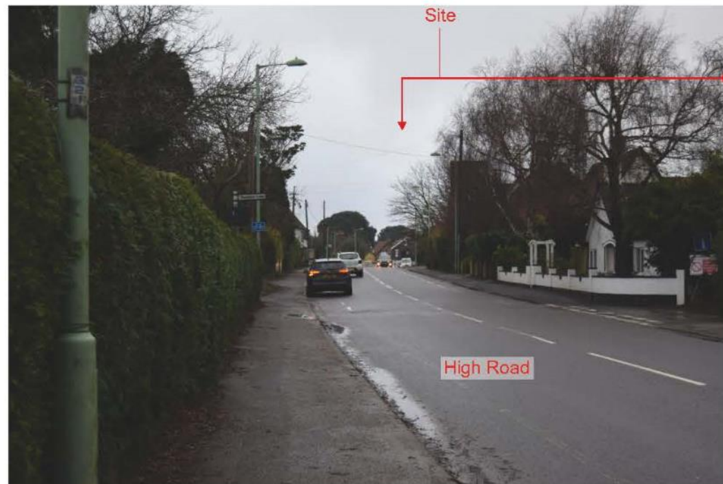
Viewpoint 18: From High Road and the entrance of Gaymers Lane, approx 250m south of the site. The site is not visible due to built form.