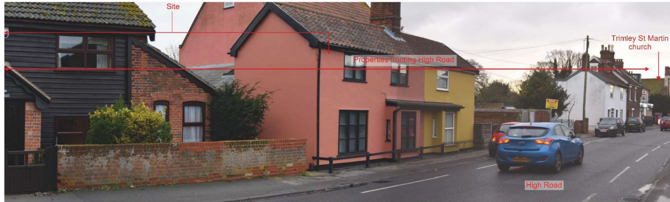
Viewpoint 15b: From footpath on southern side of High Road, looking east towards site. There is no view of the site due to the built form and associated gardens, fences and vegetation.