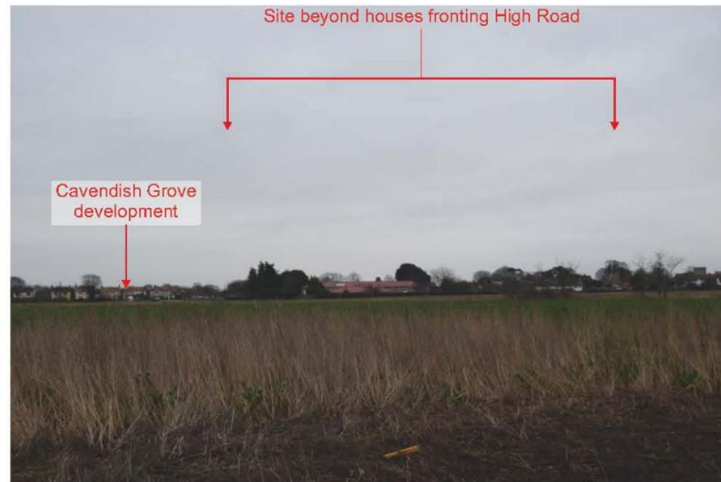
Viewpoint 20: From public footpath PRoW E-527 030/0, approx 600m from site, looking east towards site. The site is not visible due to built form.