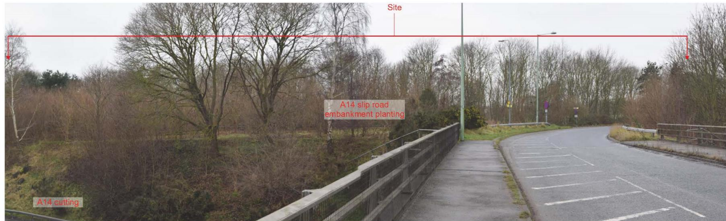
Viewpoint 10: From A14 corridor, circa 125m from site, looking south-west towards site. There are glimpsed views of the site through dense vegetation which may be lessened in the summer months when the vegetation is in leaf.