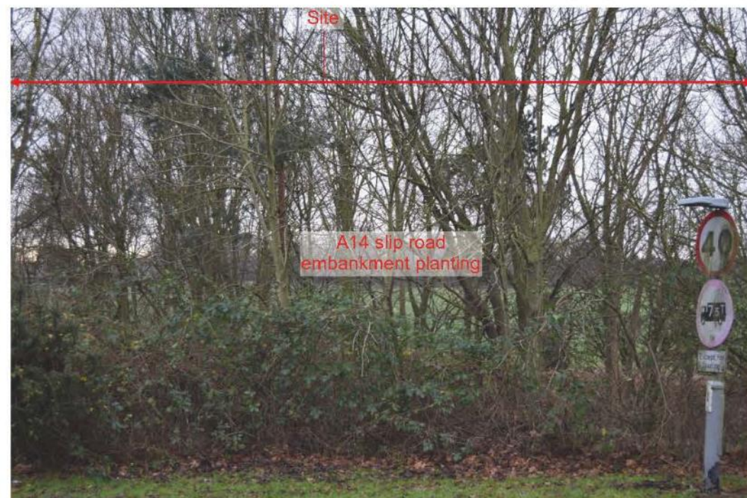
Viewpoint 9a: From the A14 Trimley St Martin slip road, looking south towards site. There are glimpsed views of the site through dense vegetation which may be lessened in the summer months when the vegetation are in leaf.