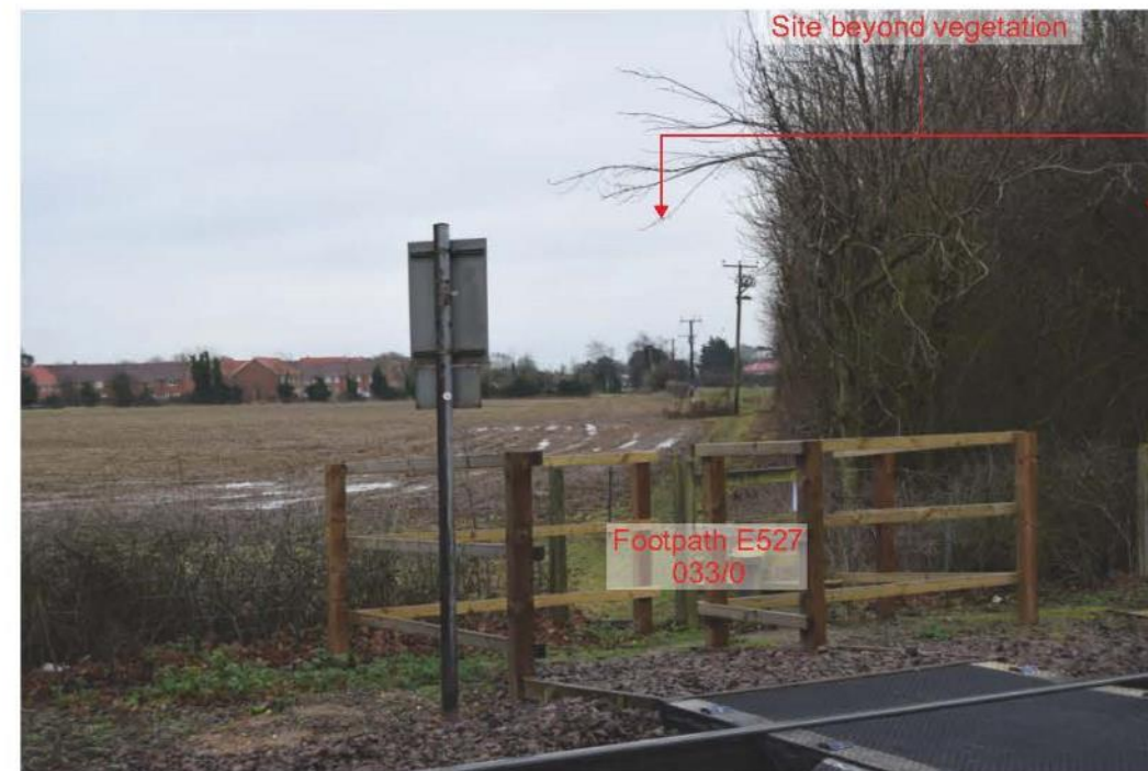
Viewpoint 21: View from PRoW Footpath E527 033/0, approx 580m from the site looking East. The site is not visible due to built form.