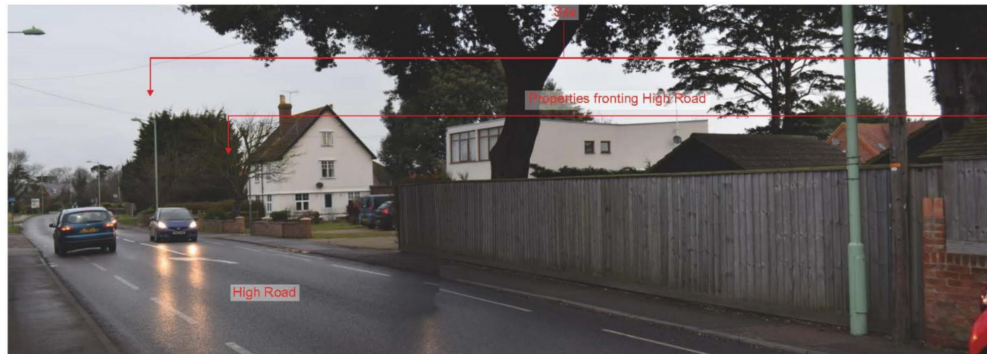
Viewpoint 15a: From public footpath on southern side of High Road, looking north towards site. There is no view of the site due to the built form and associated gardens, fences and vegetation.