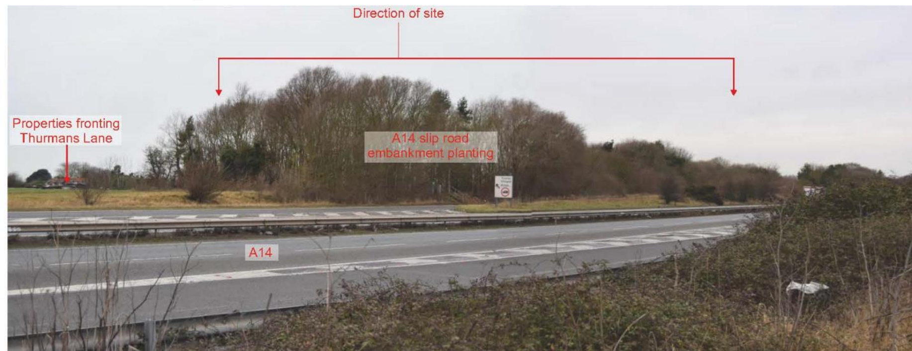
Viewpoint 26: From bridleyway E-528 040/0, looking north-west across the A14. The site is not visible due to the A14 slip road embankment and planting.