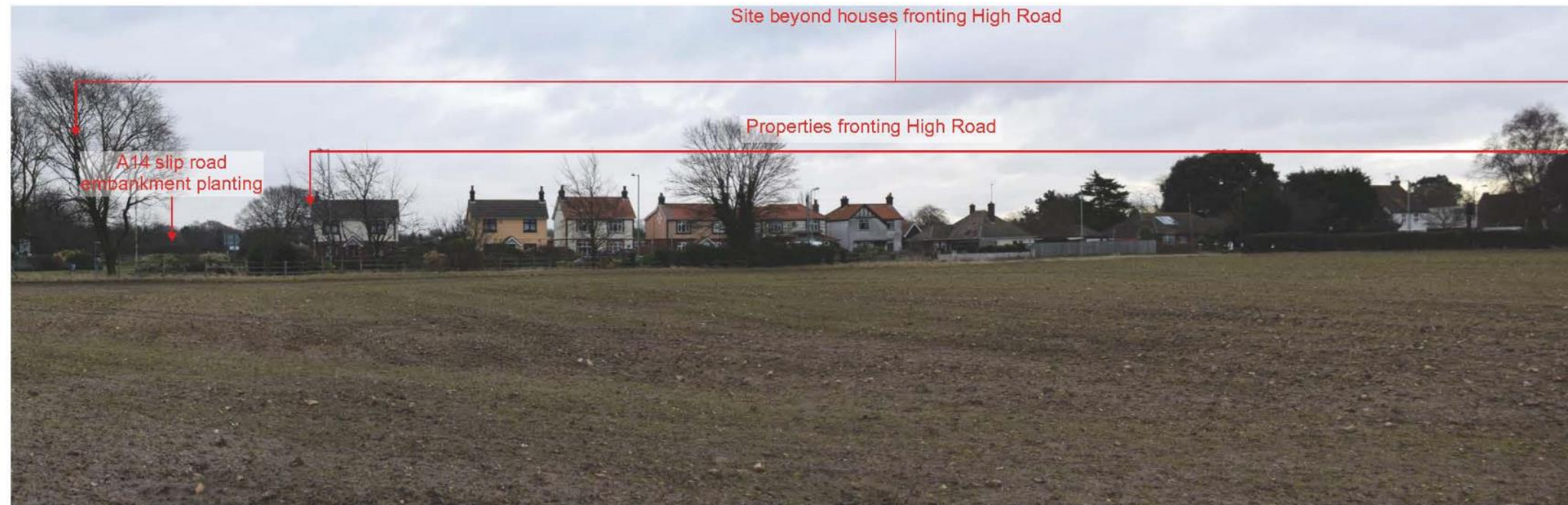
Viewpoint 14: From Footpath E-527 030/0, (circa 260m from site) looking east towards site. Only a small portion of the site is visible due the built form along High Road.